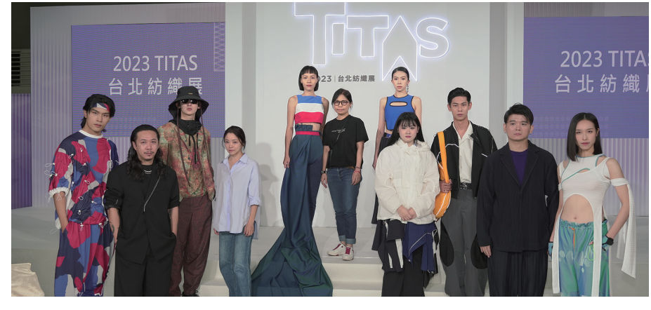
The Sustainable Fashion Show bridged the cooperation of suppliers & designer brands.

In line with industry and market development trends, TITAS 2023 presents the outcomes of Taiwan's textile industry in innovation and sustainability under three core themes: sustainability, functional applications, and intelligent manufacturing.